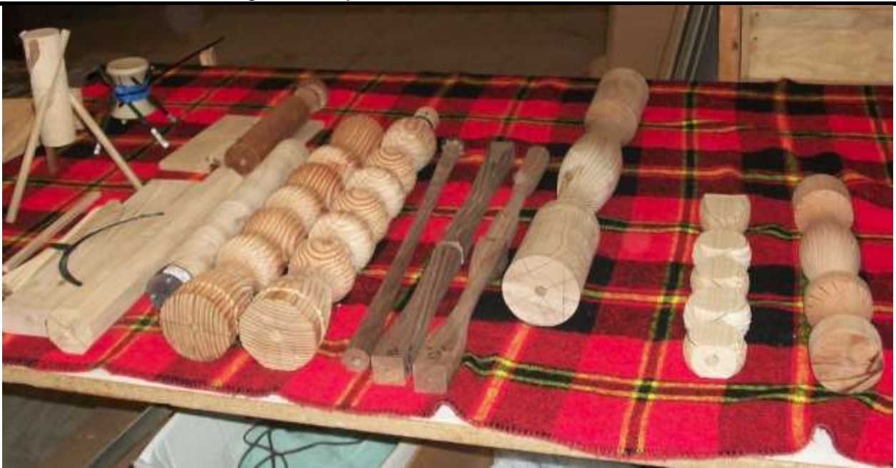
Example pieces show the range of work.