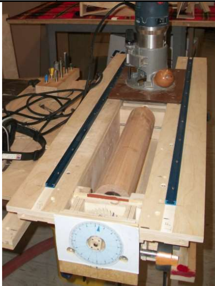
The router jig used to make these pieces