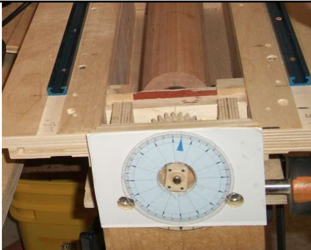
The mechanism used to index the work.