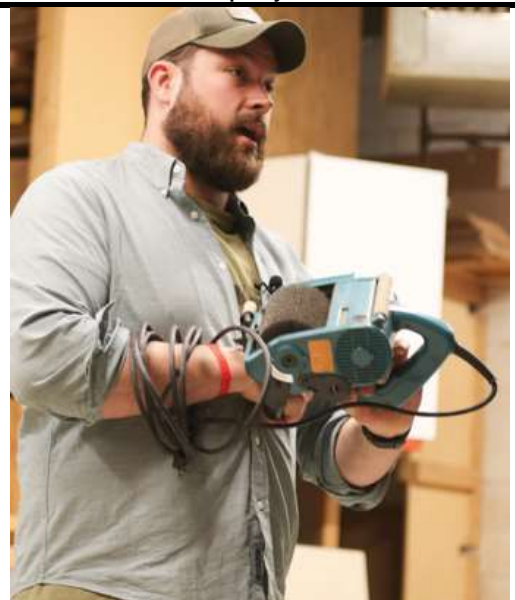
Discussion of a brush sander and comparison to the PC restorer