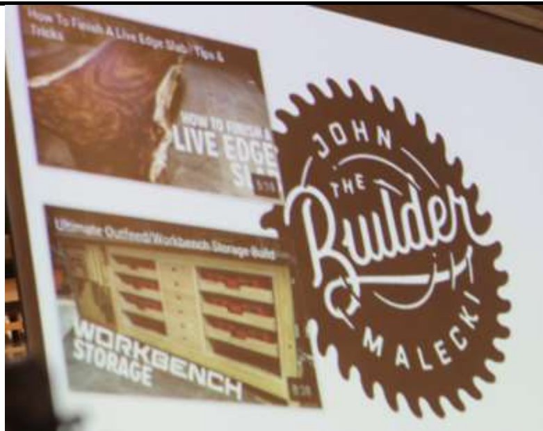
The John the Builder website