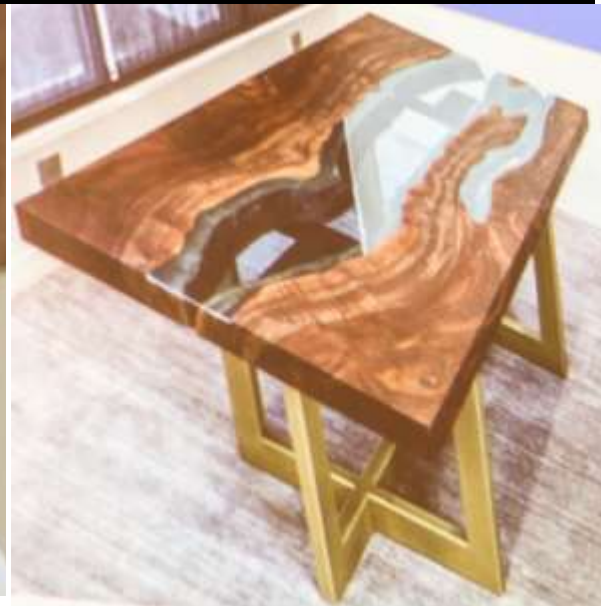
John's river table project